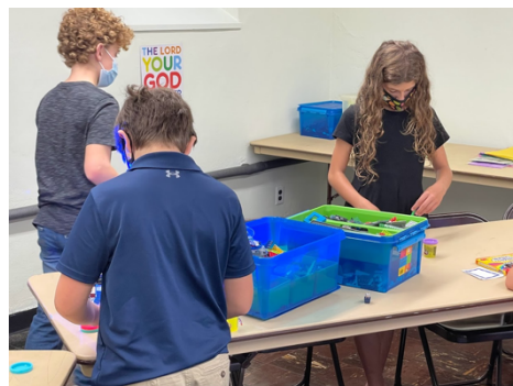
4th/5th/6th grade class making their own creations after learning about Creation

We need help in the Nursery: Looking to earn some extra cash? We are looking to staff our nursery as many of our wonderful nursery helpers headed off to college. Ideal candidates will be high school aged or older with ample babysitting experience and/or certification. Must love babies and toddlers! This is a paid position! Please reach out to Gabrielle Heimerling for more details at gheimerling@haddonfieldpres.org .